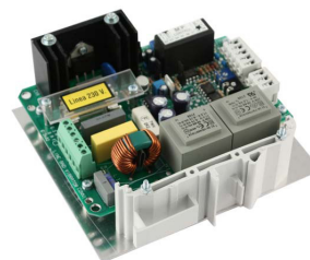
CIRCUIT CV6F/CV8F PV CV6FX D2 STD