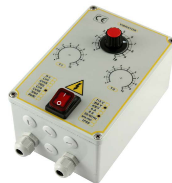
METALLIC BOX CV6F/CV8F PV CV8FX Z2 SM1 PV CV10F Z2 SM1 PV CV12F Z2 SM1 195x130x90