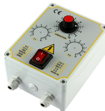
PLASTIC BOX CV6/F PV CV6FX Z2 STP 165x130x70