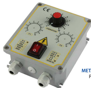
METALLIC BOX CV6F PV CV6FX Z2 STM 165x140x65